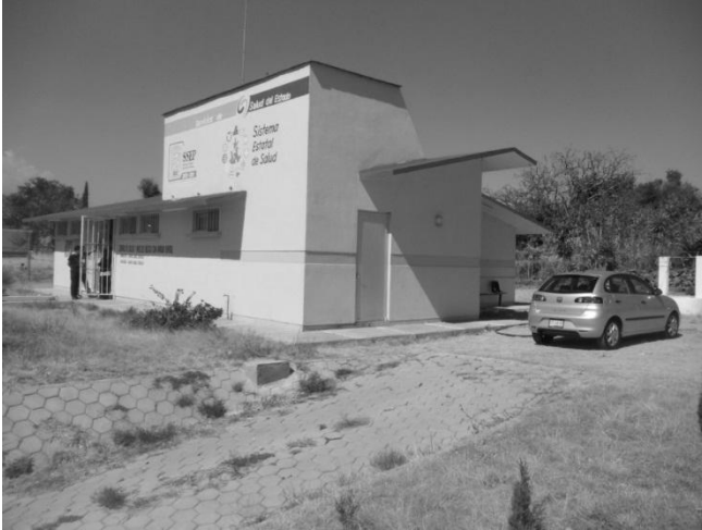
Fig. 1: Health Clinic at the Community of Santa Isabel Cholula in the State of Puebla in México before the project was undertaken.

Faculty and students, from Universidad de las Américas-Puebla in México and Appalachian State University in Boone, North Carolina U.S.A., participated in a project to design, build and install two systems (photovoltaic and thermal solar) based on the use of solar radiation for heating water and supply electricity in a community building for a population in a rural community near UDLAP's campus. A photo of the clinic is shown as Figure 1.